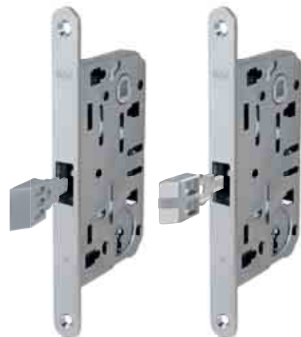
Polyamide latch version