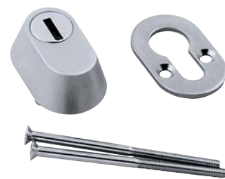
Oval (21 mm distance between screw holes centers)

Choose the thickness "X" according to the cylinder protrusion "S":