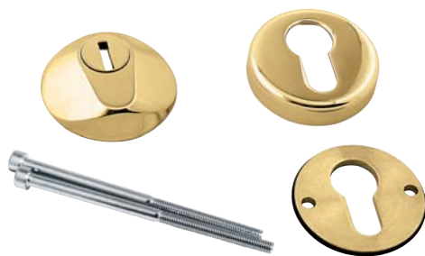
Round (38 mm distance between)

NB. Tenax can be used with all the AGB SCUDO cylinders.