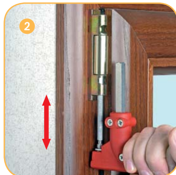
Inserimento ed estrazione del perno dal supporto forbice con inserto.