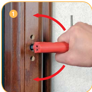
Movimentazione del cremone con quadro maniglia da 7 mm.