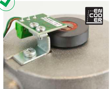
Check on the movement of motor by encoder which guarantees precision and safety