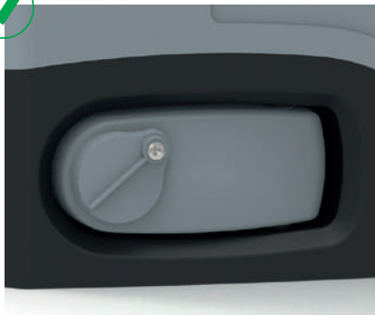
Safety unlocking device with personalized key